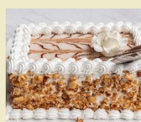
Esterhazi ..... 1850 rsd/kg (berliner cream, butter cream, walnuts, hazelnuts)