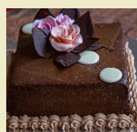
Ana ..... 1850 rsd/kg (Belgian chocolate)