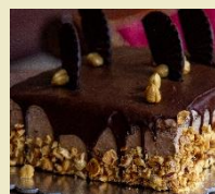
Napoleon .....1850 rsd/kg (belgian chocolate, vanilla cream with huzelnuts)