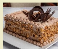
Pariska .....1850 rsd/kg (walnuts, chocolate, french cream)