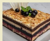
Purple Sonata 1890 rsd/kg (brownies crust, French vanilla cream, capuccino, blueberry puree, almonds)