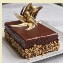
Reform .....1850 rsd/kg (chocolate, walnuts, butter)