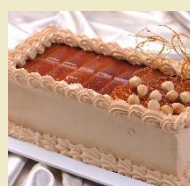
Doboš .....1850 rsd/kg (hazelnuts, chocolate cream, caramel icing)