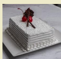
Schwarzwald ..... 1850 rsd/kg (chocolate, cherrys, cherry liquer)