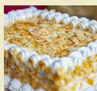
Moskva schnit .....2050 rsd/kg (cherry, peaches, pineapple, champones cream, almonds, walnuts)

Moskva cafe and pastry shop being one of the oldest and best known, is a meeting point of Belgrade people of all ages. Its pleasant atmosphere, old charm and highest hospitality standards are a perfect city escape from the crowd and fast-paced lifestyle.