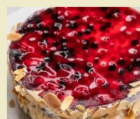
Cheesecake .....1850 rsd/kg (mascarpone cheese, mixed berries, biscuits)