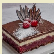
Simfonija .....1850 rsd/kg (cream, chocolate, sour cherry, brownies crust)