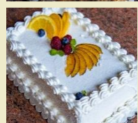
Tuti fruti .....1850 rsd/kg (raspberries, pineapple, peaches, fresh cream, walnuts)